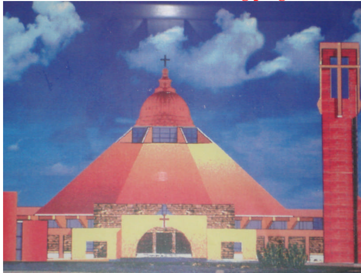
When complete St. Michael Church will look like this