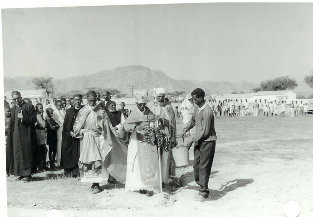
Site Blessing by Abune Abraha