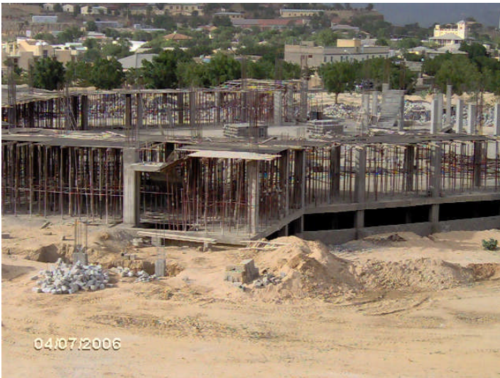
Completion of basement and beginning of Mezzanine