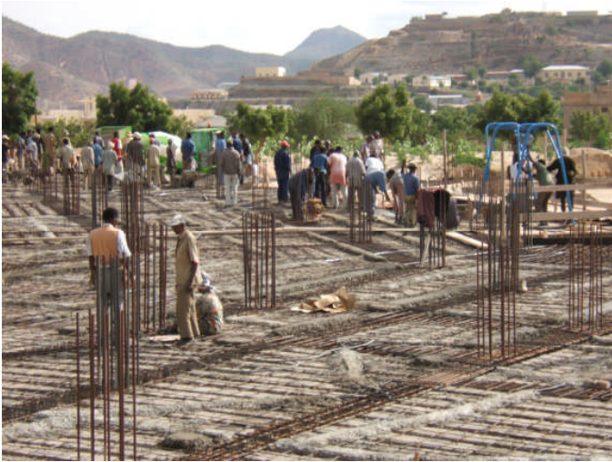
Underground concrete work in progress