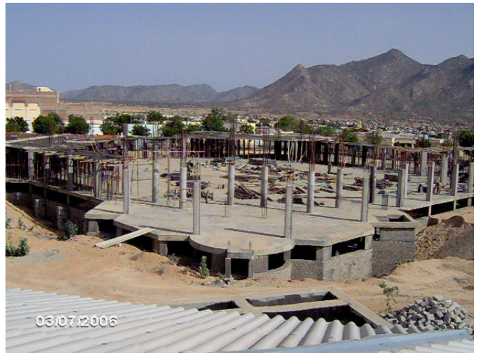
Progress of the mezzanine of St. Michael church

More pictures will follow as significant progress is achieved. Please pray and open your wallets to make a donating for this worthy cause; building a house of worship where God will be glorified every day.