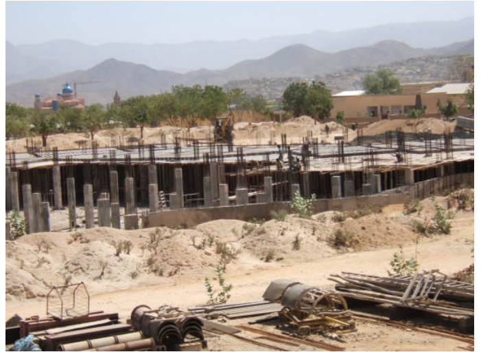
Underground almost covered with concrete slab