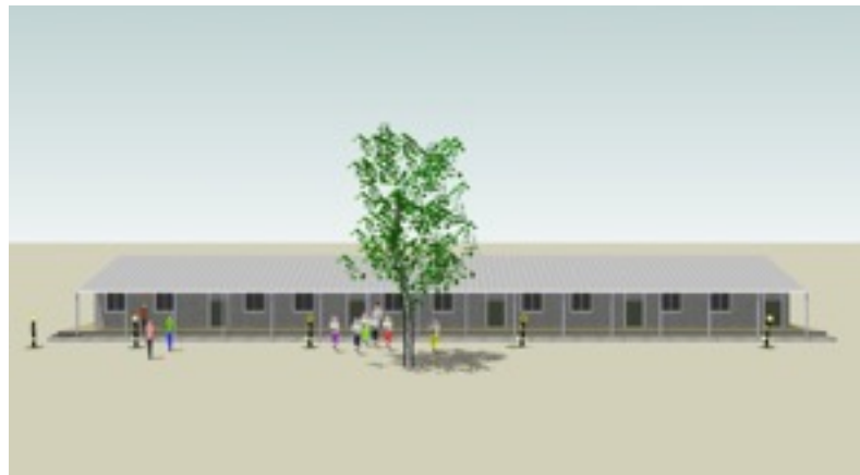
View of one block