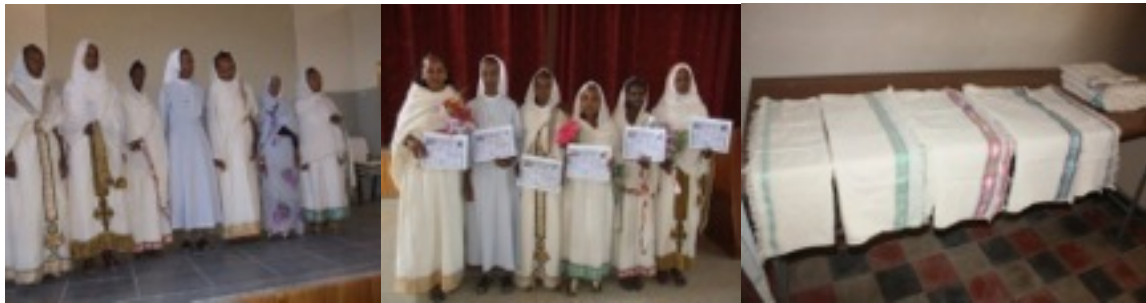
Trainees during celebration

2. Hand weaving program. A newly established hand weaving program is one the promising activities to the Eritrean rural women. The activity is established with seven locally made machines for one year training and successfully graduated its first batch trainees on May 2013. After assessing the need and completing the pilot project for one year, the Department had added another 15 new machines and is now training 22 mothers for one year.